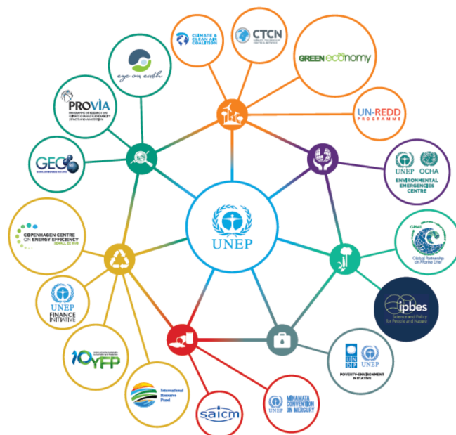
Figure 2: Examples of cross-cutting policies and programmes that can be expanded and enhanced to embed the principles of the 2030 Agenda and forge partnerships with stakeholders working in related sectors.

23. Furthermore, non-state actors play a role in advocacy e.g. through environmental NGOs and their inputs to international treaties. Through www.MyUNEA.org , a moderated interactive online-hub hosted by UNEP, stakeholders are being encouraged to participate in the preparations of UNEA-2. In the run-up to UNEA-2, the platform will provide an opportunity for the public to contribute ideas to the implementation of the 2030 Agenda and in preparations of the global thematic report, “Healthy Environment-Healthy People,” which will be launched at UNEA-2. This will help provide governments and policy makers with inputs from a wide spectrum of stakeholders on issues and options/solutions.