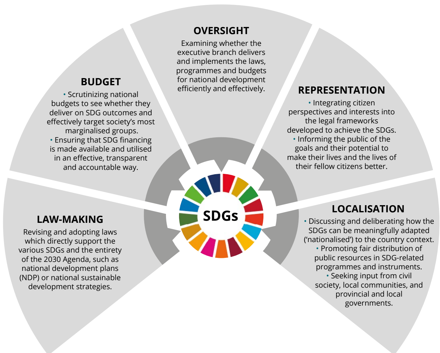
Figure 2: Parliaments and the SDGs.

This handbook provides a comprehensive overview of how parliaments worldwide can and do engage in the SDG process. While it is designed as an easy-to-use reference point for parliamentarians and parliamentary staff, it can help all development actors navigate through parliament's role in implementing the SDGs. The handbook lists good practices and tools from around the world that can be adapted, as needed, to the national context.