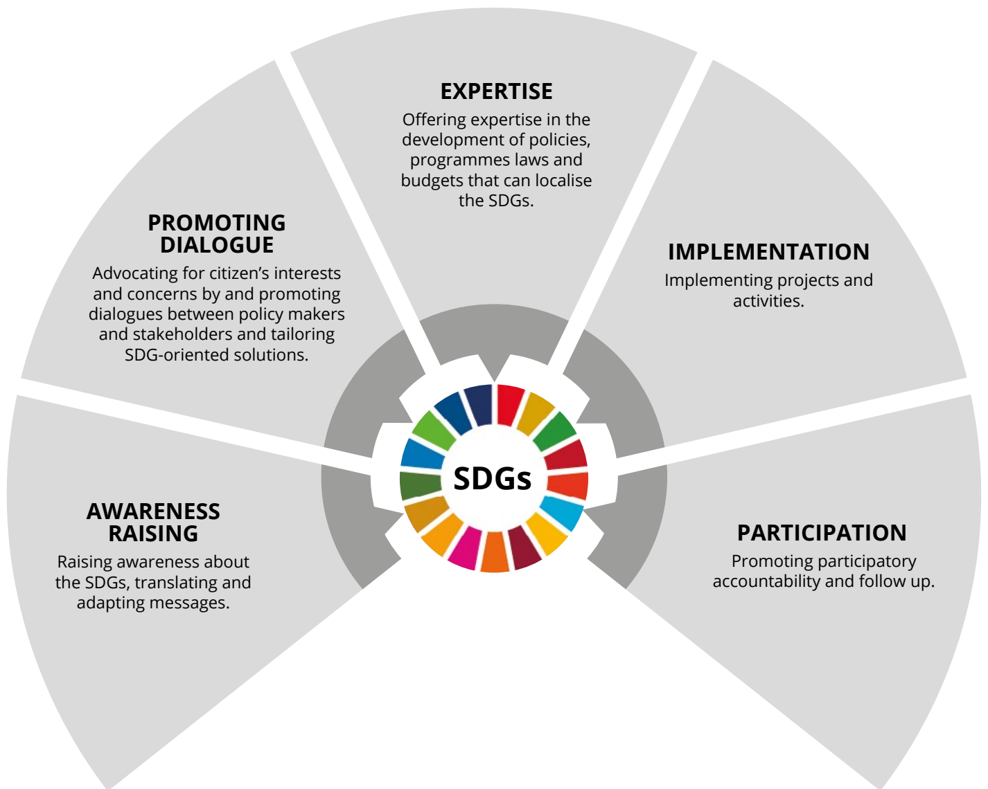
Figure 1: CSOs and the SDGs.